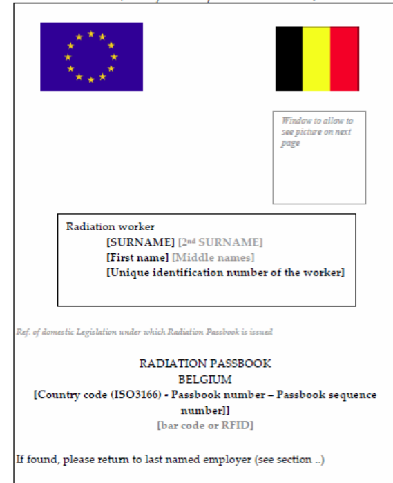
FRONT COVER (Identification of Radiation Worker)