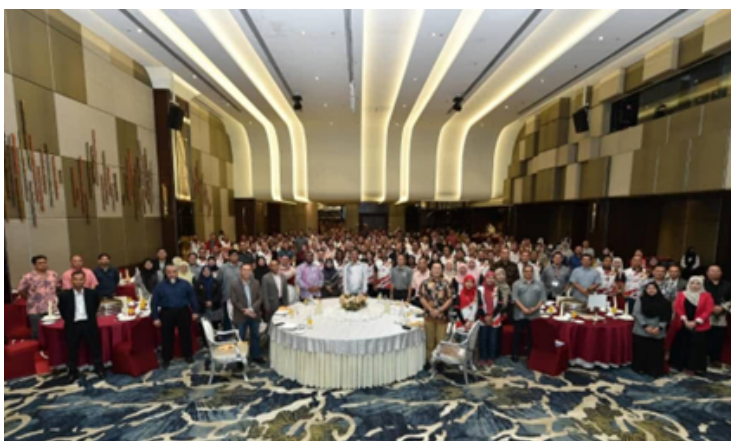
Radiation Protection Conference 2024 dinner at Johor Baharu, Malaysia