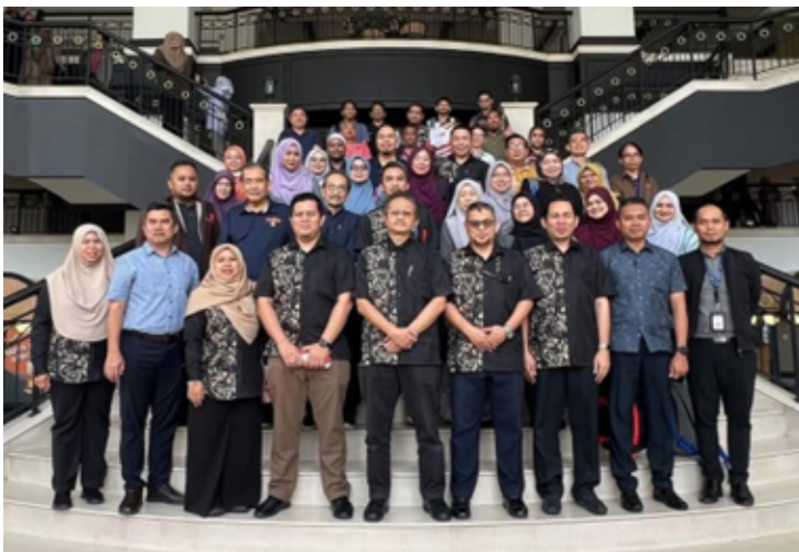
MARPA committee in the front line after the 2024 Annual General Meeting

MARPA plays a crucial role as a member of the Nuclear Technology Technical Committee, ensuring that all plans under Malaysia's National Nuclear Technology Policy are properly implemented and monitored.