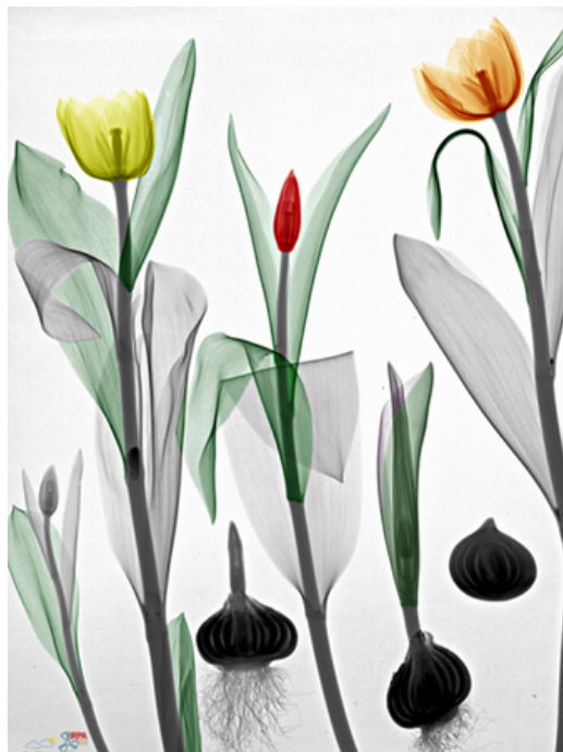
Figure: X-ray art work 'Stages of Tulips – inspired by 'Encouraging Sustainability in Radiation Protection'