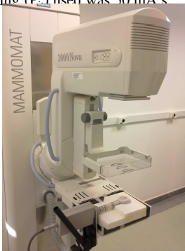
Set-up for K_i and HVL measurements

The D_G was derived from measurements of the free-in-air incident air kerma ( K_i ) and tabulated conversion coefficients that are dependent on the X-ray quality represented by the half-value layer (HVL) of the X-ray spectrum. Irradiations were done in a 3000 Nova model Siemens MAMMOMAT mammographic unit in a cranio-caudal view, with the compression plate in position and a load cassette in the bucky. Protocols with 26, 28, 30 and 32 kV were used for Mo/Mo and Mo/Rh combinations. The distance between focus and the 90X5-6M model Radcal ionization chamber was 60.5 cm and the tube loading ( P_{It} ) used was 50 mA s.