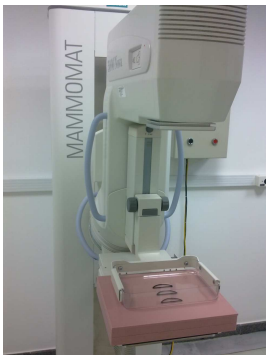
Set-up for D_G measurements using phantom with glandularity of 70%

Computerized Imaging Reference Systems, Inc phantoms used for the determination of D_G had 45 mm thick, which approximately simulates a standard breast with glandularities of 0, 30, 50, 70 and 100%.