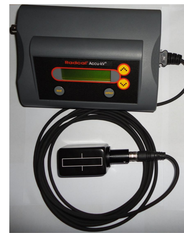
Radcal Accu-kV ® noninvasive meter