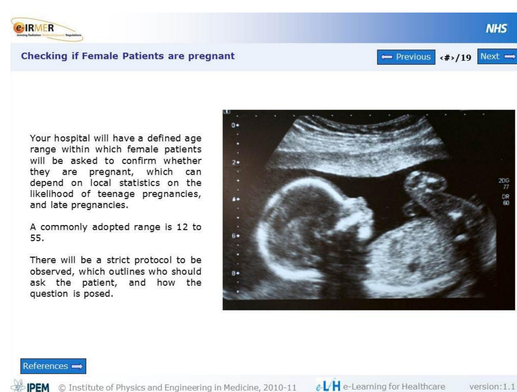
Figure 1 - Example of a slide from one of the sessions

Traditionally in the UK, training has been provided for referrers by medical physicists, radiographers and radiologists at approved one or half day courses, with staff being issued with certificates of attendance. However, attendance at such courses can be difficult for a variety of reasons, including increased work pressure on staff. Moreover, the universal use of computers within the National Health Service (NHS) and at home, provides an opportunity for e-learning.