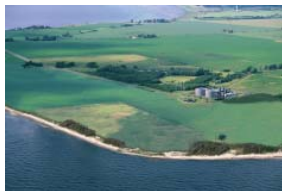
Will "Green field" be the final goal? Manipulated photo.