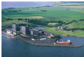
Barsebäck NPP today.